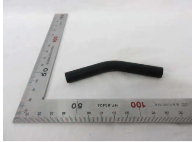
Sample No. 2